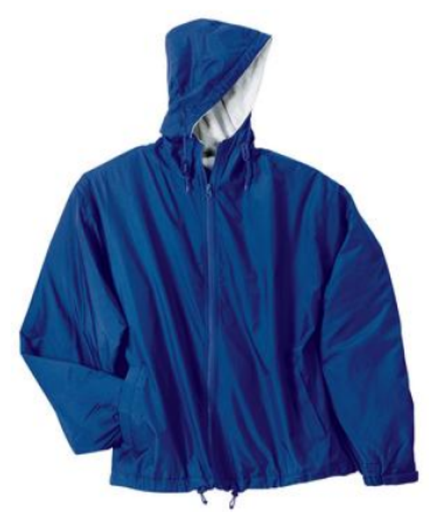
Port Authority Team Jacket

Elastic cuffs with adjustable velcro tabs Elastic waistband