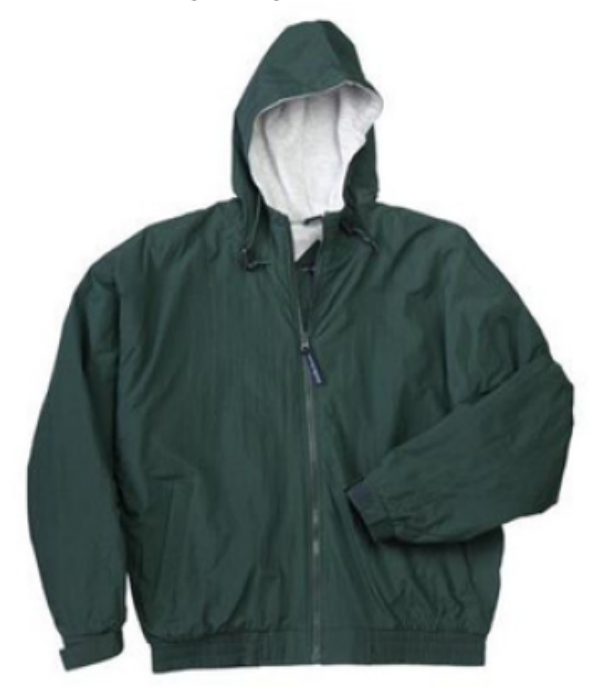
Port Authority Warm -up Jacket

There are two styles of jackets to choose from: